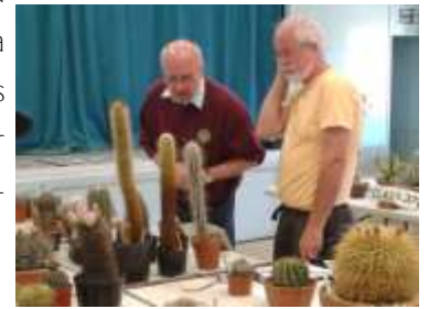
"Mind the splinters!"